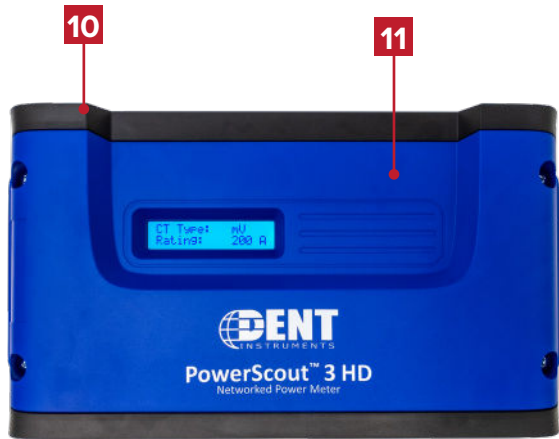
WALL MOUNT ENCLOSURE PS3HD-C-D-N