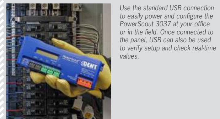
Use the standard USB connection to easily power and configure the PowerScout 3037 at your office or in the field. Once connected to the panel, USB can also be used to verify setup and check real-time values.