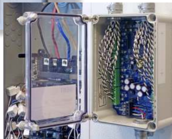
Right: The PowerScout is line-powered and the broadband power supply accommodates voltages from 80-600VAC.