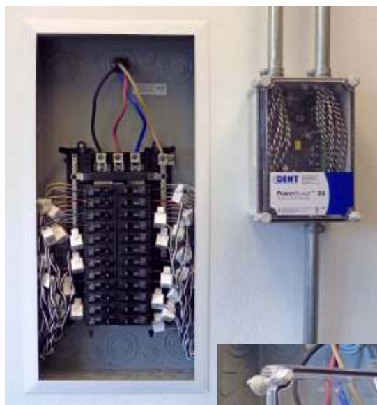
Left: The PowerScout 24 can use up to 24 CTs to measure any combination single or three-phase loads. Mix and match any of DENT's RoCoil or Split core CTs to monitor building mains and smaller loads simultaneously with a single meter.