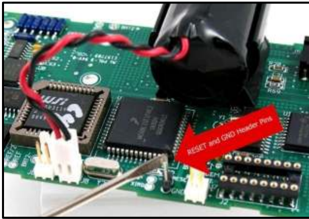
DATApro RESET and GND Pins