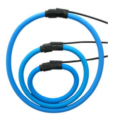
DENT's RoCoil Current Transformers. 16", 24", and 36" lengths pictured.

Current Transformer accuracy is usually calibrated with the conductor centered in the CT window. In practice, the CT hangs on the conductor, as shown in figures 1 and 2, which can introduce measurement errors. Note that the error is greatest when the CT connector hangs on the conductor.