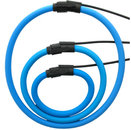
DENT's RoCoil Current Transformers. 16", 24", and 36" lengths pictured.

Visit the DENT website or contact us for further information.